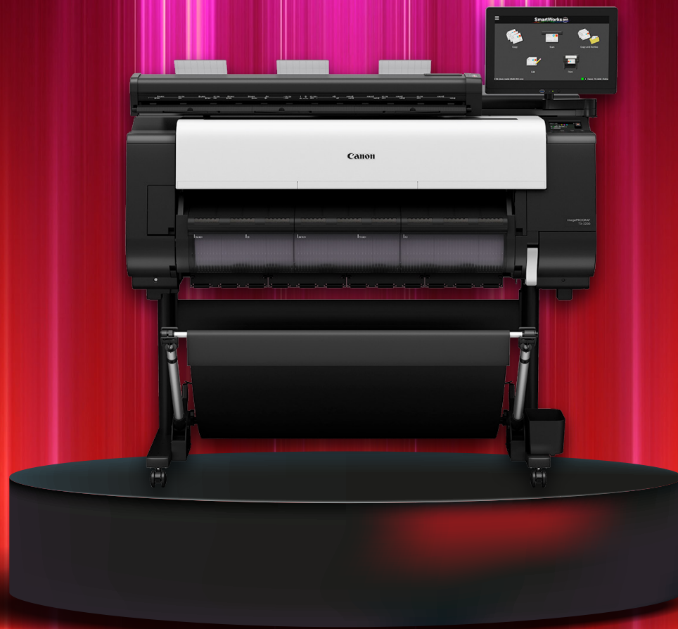
imagePROGRAF TX-3200 MFP Z36