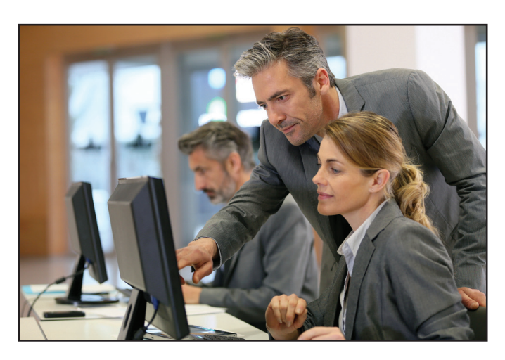
KYOCERA'S DOCUWARE CONNECTOR PROVIDES UNPRECEDENTED DOCUWARE INTEGRATION AND EASE-OF-USE.

Companies know the importance of access to information. Document management systems such as DocuWare® offer users many key benefits, including document archiving and retrieval, collaboration, and automated workflows; however, the information stored in a document management system is most useful when it is easily accessible. That is why it is so important for organizations to control the way information is stored from the onset. The solutions that deliver the best ROI are ones that provide this information access and control efficiently without infringing on employee productivity.