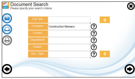
Searchable fields allow for fast indexing